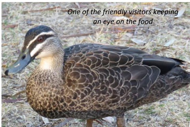
One of the friendly visitors keeping an eye on the food

Crossing over the Reid Highway heading down to Guildford we cross the river to the roundabout and back over the bridge. We decided this was the safest way to get into the park by the river for the picnic. Job done!