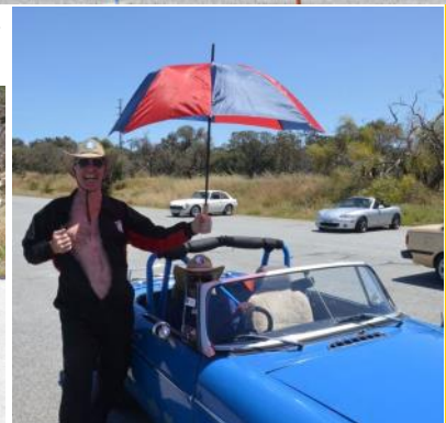
Moyra's 'Pit Bitch'