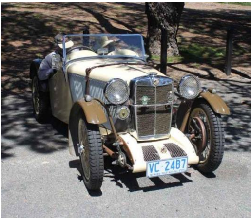
Allan Briggs' PA